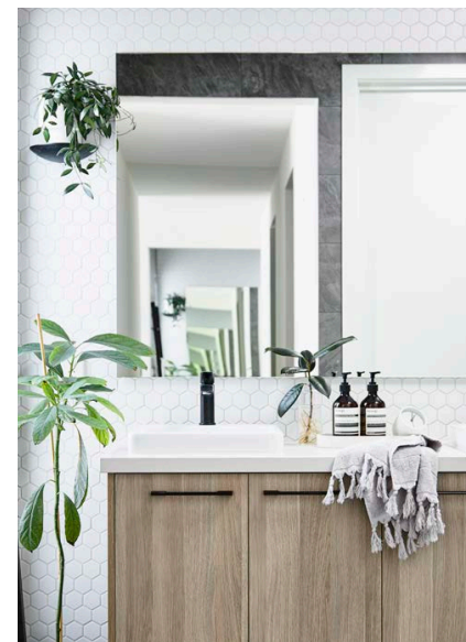
Matt black Caroma taps and the Polytec Ravine cabinetry bring luxe to the ensuite.