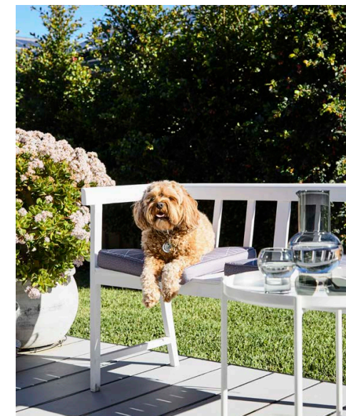
Bella poses on a Kmart bench painted white (Ikea table, and Ro glassware set from Kiss With Style).