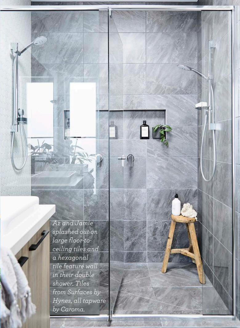
Az and Jamie splashed out on large floor-to-ceiling tiles and a hexagonal tile feature wall in their double shower. Tiles from Surfaces by Hynes, all tapware by Caroma.