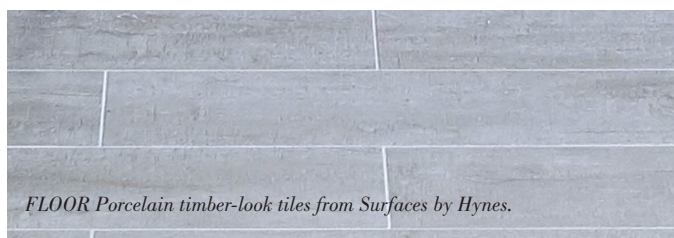
FLOOR Porcelain timber-look tiles from Surfaces by Hynes.