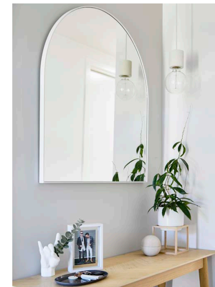
'Hand' vase from Kiss With Style and ceramic oval tray from Norsu Interiors.

ACTUAL PAINT COLOURS MAY VARY ON APPLICATION