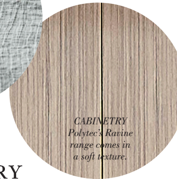
CABINETRY Polytec's Ravine range comes in a soft texture.