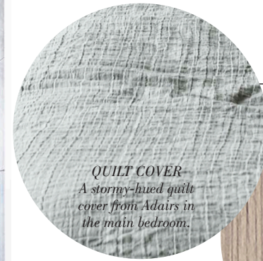
QUILT COVER A stormy-hued quilt cover from Adairs in the main bedroom.