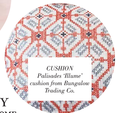
CUSHION Palisades ‘Illume’ cushion from Bungalow Trading Co.