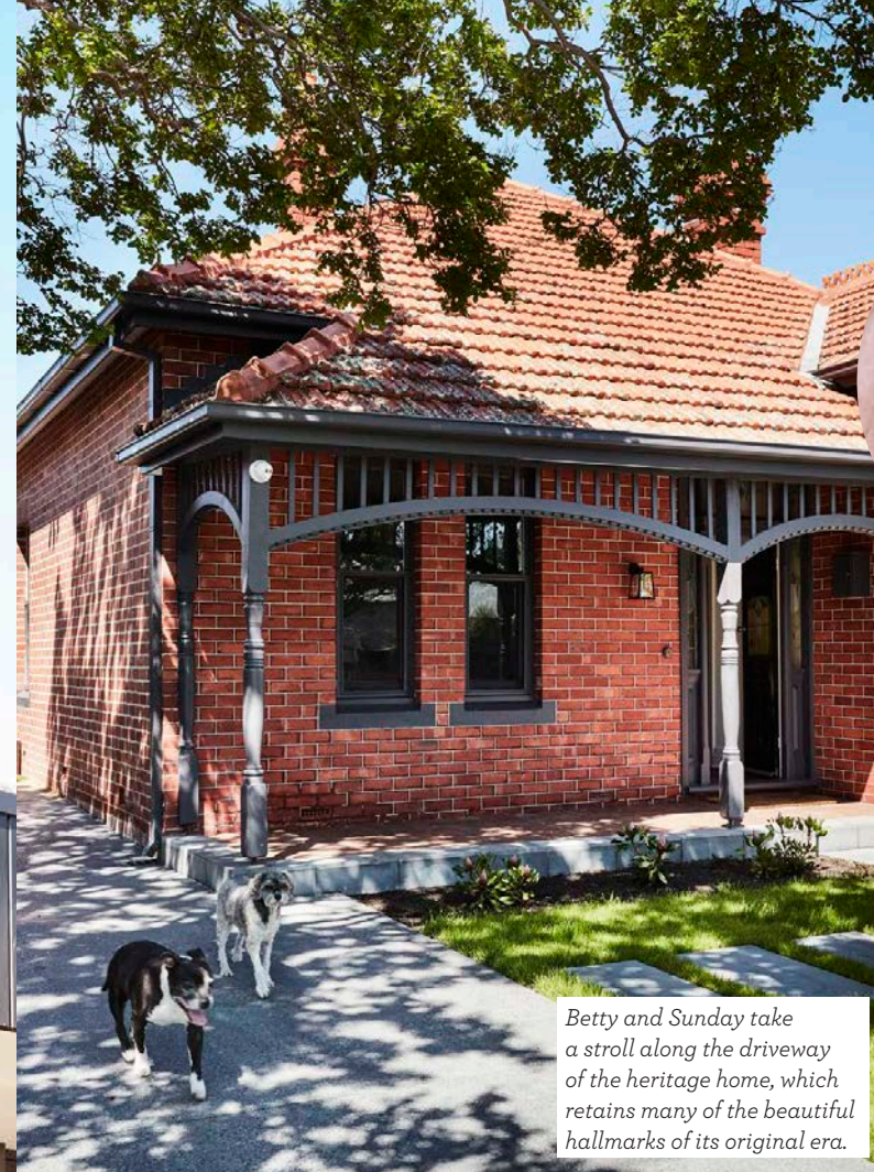
Betty and Sunday take a stroll along the driveway of the heritage home, which retains many of the beautiful hallmarks of its original era.

EXTERIOR Floor-to-ceiling powder-coated aluminium-framed glass doors slide open to the inviting alfresco deck and garden (below), where a new pool beckons. “The western side of our house borders three of the neighbours’ back gardens, so we have the sun out here all day long,” says Sally.