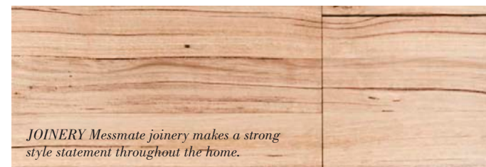
JOINERY Messmate joinery makes a strong style statement throughout the home.