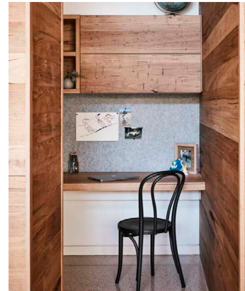
“I love this open study, which is accessible from the kitchen,” says Sally.