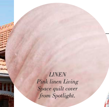
LINEN Pink linen Living Space quilt cover from Spotlight.